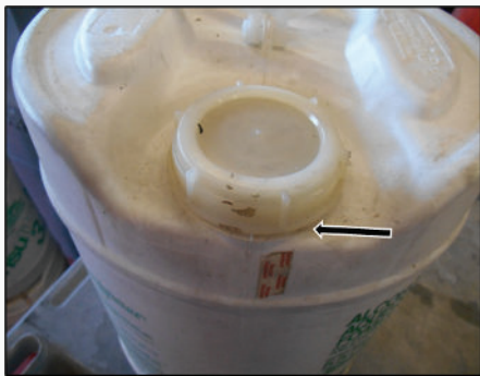
Worn/broken and misaligned tape seal as an indication that the cap has been potentially opened.

If the original seal is not fully intact, the container is considered unsealed. A sealed container is a covered, closable container that has been unopened but also has its original, fully intact seal. Below are images for reference.